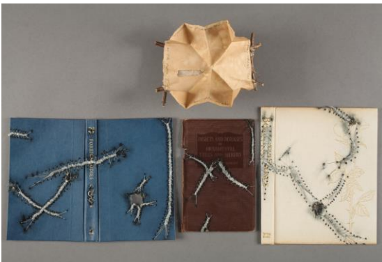
What is the native, 2014, wall installation

Repurposed book covers, pencil, waxed linen thread, kozo gampi torinokoshi paper, twigs, wool, leaf and insect matter, adhesives, fixative